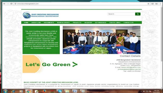
JCM Secretariat Bangladesh http://bocmbangladesh.com/index.php