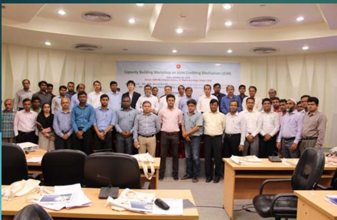
Capacity Building workshop in FY 2016