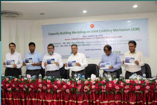
Launching of JCM in CHARTs