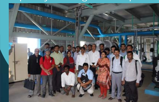
Demonstration field visit to the first JCM Model project