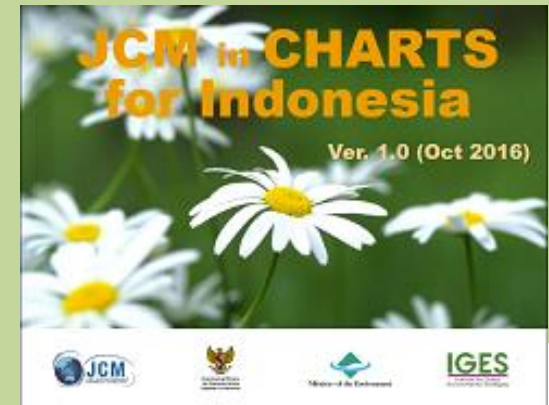
JCM in CHARTS for Indonesia (ver. 1.0)