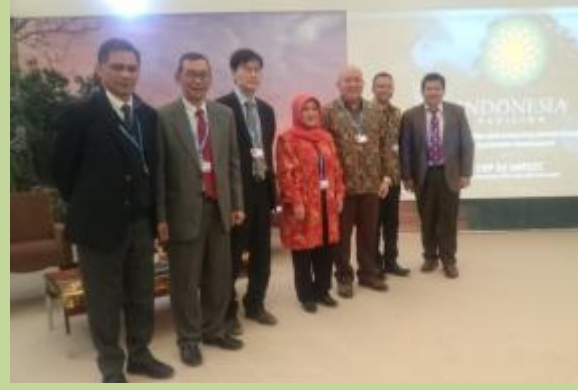
Indonesia Pavilion Side Event : Advantages and Challenges of Market Based Implementation in Indonesia at COP 22