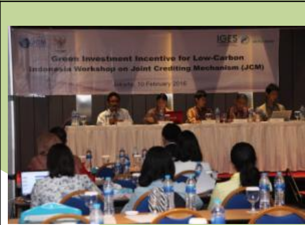
Green Investment Incentive for Low-Carbon Indonesia: Workshop on the Joint Crediting Mechanism (JCM)