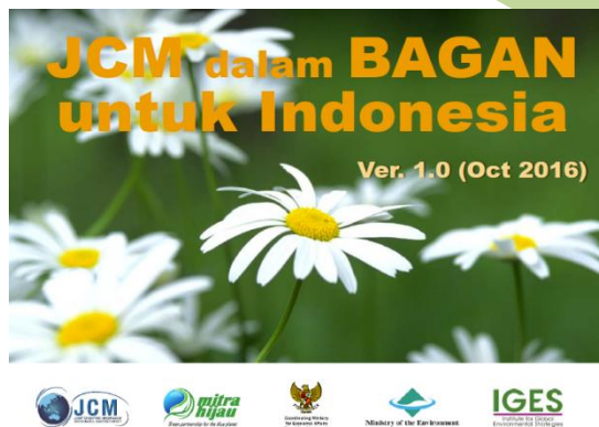
JCM dalam BAGAN untuk Indonesia (ver.1 .0)