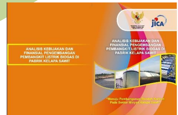
Analisis Kebijakan dan Finansial Pengembangan Pembangkit Listrik Biogas di Pabrik Kelapa Sawit