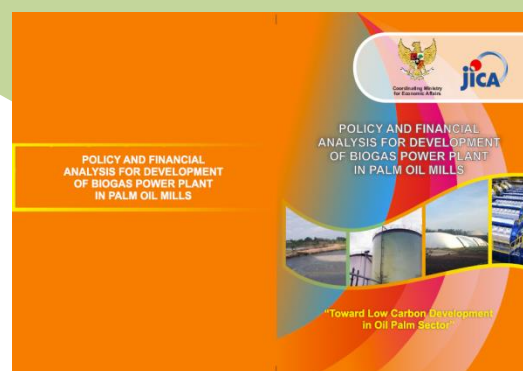
Policy and Financial Analysis for Development of Biogas Power Plant in Palm Oil Mills