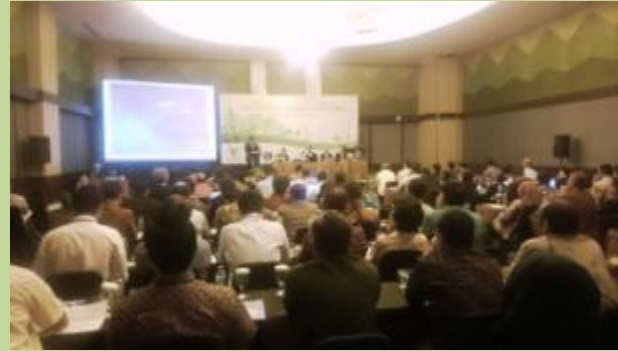
Reporting Meeting on JCM Feasibility Studies in JFY2015 at Bogor