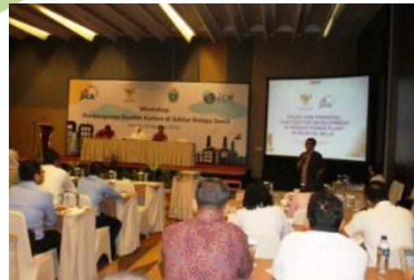
Workshop on Low Carbon Growth in Palm Oil Sector