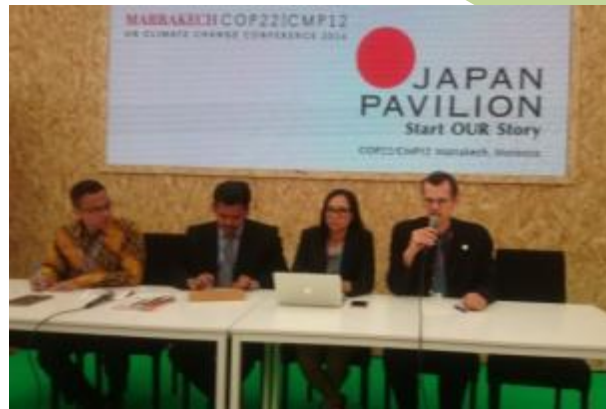
Japan Pavilion Side Event : Updates on Mitigation and Measures towards Low Carbon at COP 22