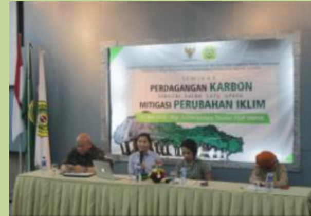
Seminar "Carbon Trading as one of Climate Change Mitigation Effort"