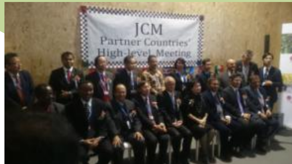
4 th JCM High Level Meeting at COP 22