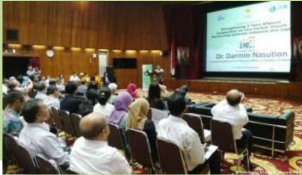
National Seminar on Strengthening 3 Years Bilateral Cooperation on Low-Carbon Growth Partnership between the Republic of Indonesia and Japan