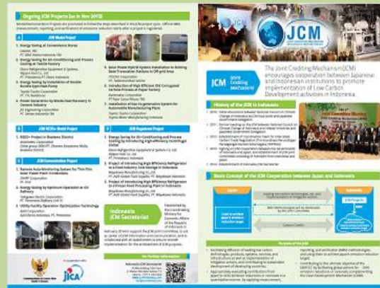
JCM Brochure Ver. 02