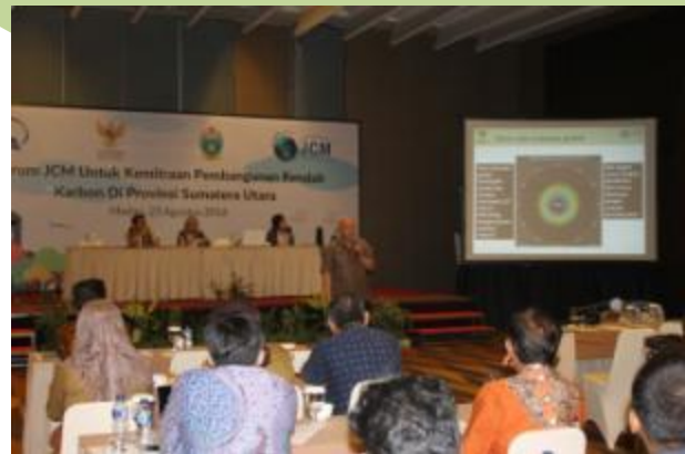
JCM Forum for Low Carbon Partnership in North Sumatera Province