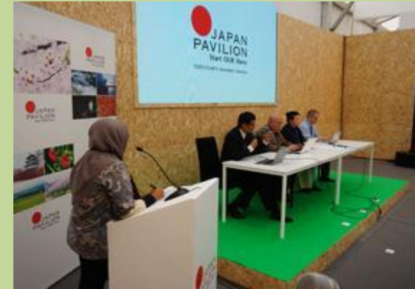
Japan Pavilion Side Event : MRV Implementation Development in Indonesia, a JCM case study at COP 22