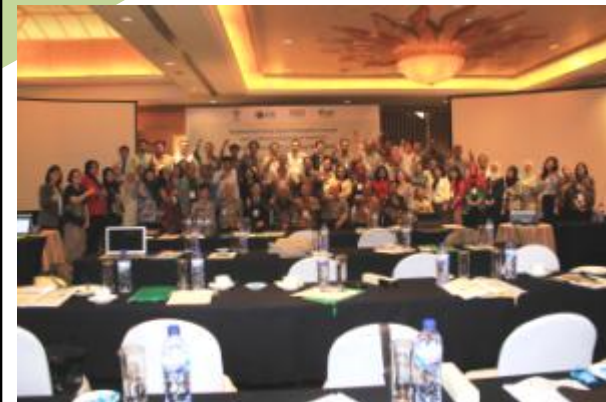
Accelerating Private Sector Participation towards Low-Carbon Development in Indonesia: Workshop on the Joint Crediting Mechanism (JCM)