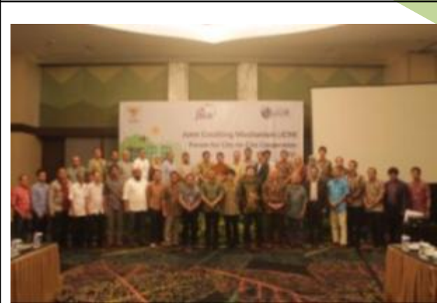
JCM Forum for City to City Cooperation 2016